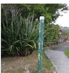
Stokes Valley Road

greater WELLINGTON REGIONAL COUNCIL Te Pahi Mātua Tāiao