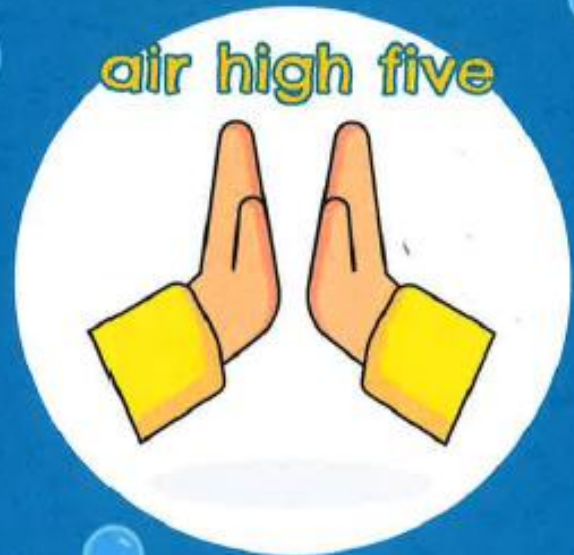
air high five