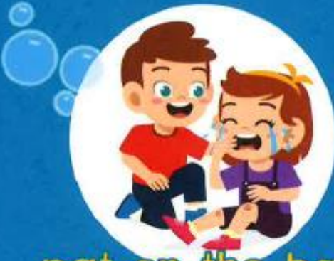
pat on the back