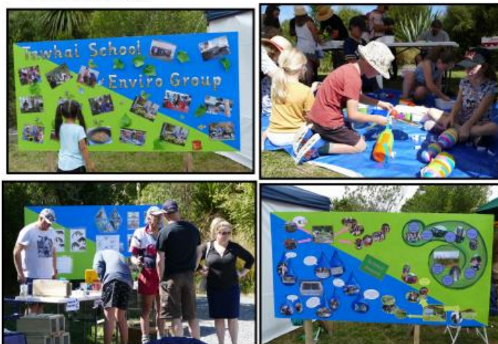
Past Family Days: