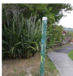
Stokes Valley Road

greater WELLINGTON REGIONAL COUNCIL Te Pare Matua Teāroa