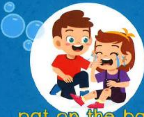
pat on the back