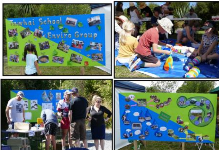
Past Family Days: