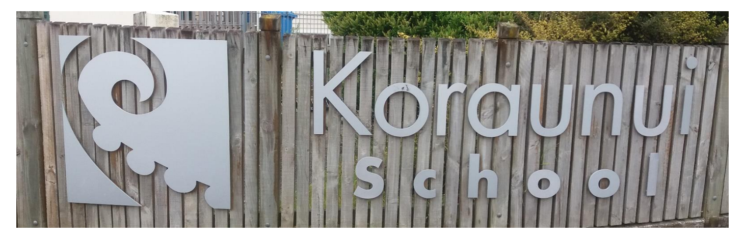
Poipoia te kākano kia puāwai – Nurture the seed and it will thrive