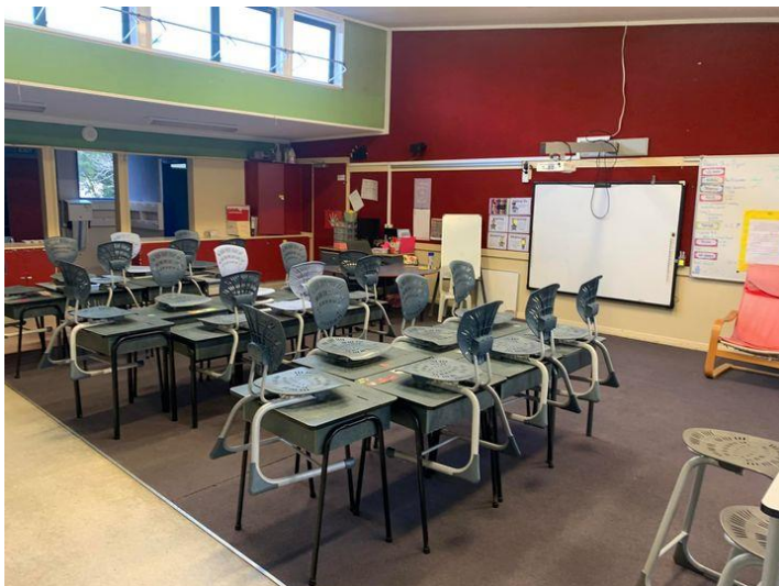
Room 14 (in Room 10)