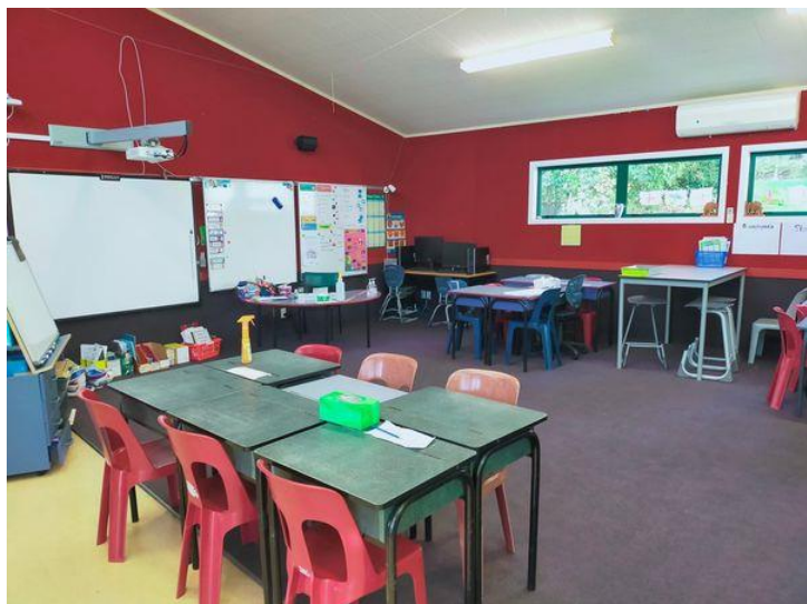
Room 15 (in Room 12)

Builders will be on site from tomorrow to begin removing flood damaged linings and carpets from Rooms 14 & 15.