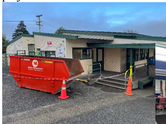
Room 7 & 8 almost ready for the contractors

We plan to set up a blog so we can keep everyone up to date with the progress throughout the project.