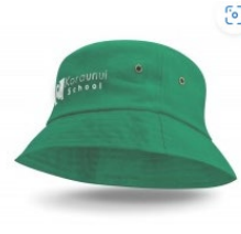
Koraunui School Hat